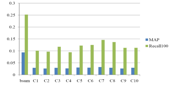
Figure 4: Retrieval performance of category features.