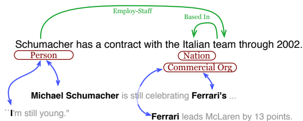
Figure 1: Information Extraction: 3 mentions labeled with entity types (red), relations (green), and coreference (blue links).

http://dx.doi.org/10.1145/2509558.2509559 .