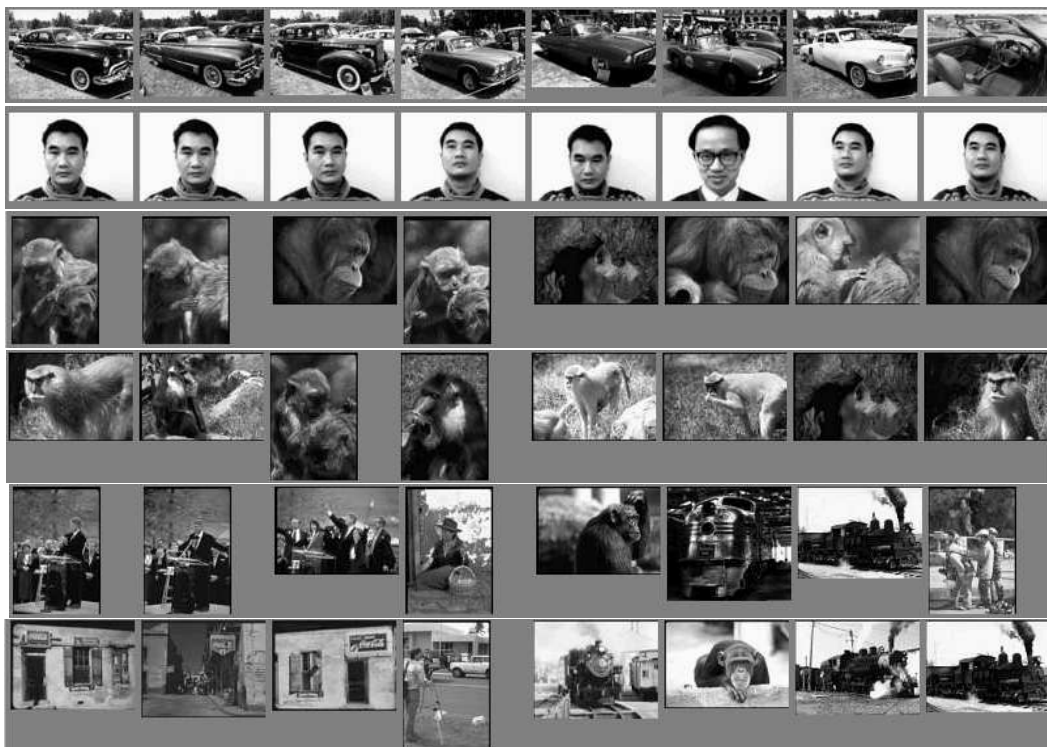
Figure 2: Image retrieval using Curvature and Phase

(also had Coca Cola logos) were retrieved (100% precision), two other very dissimilar images with coca-cola logos were not.